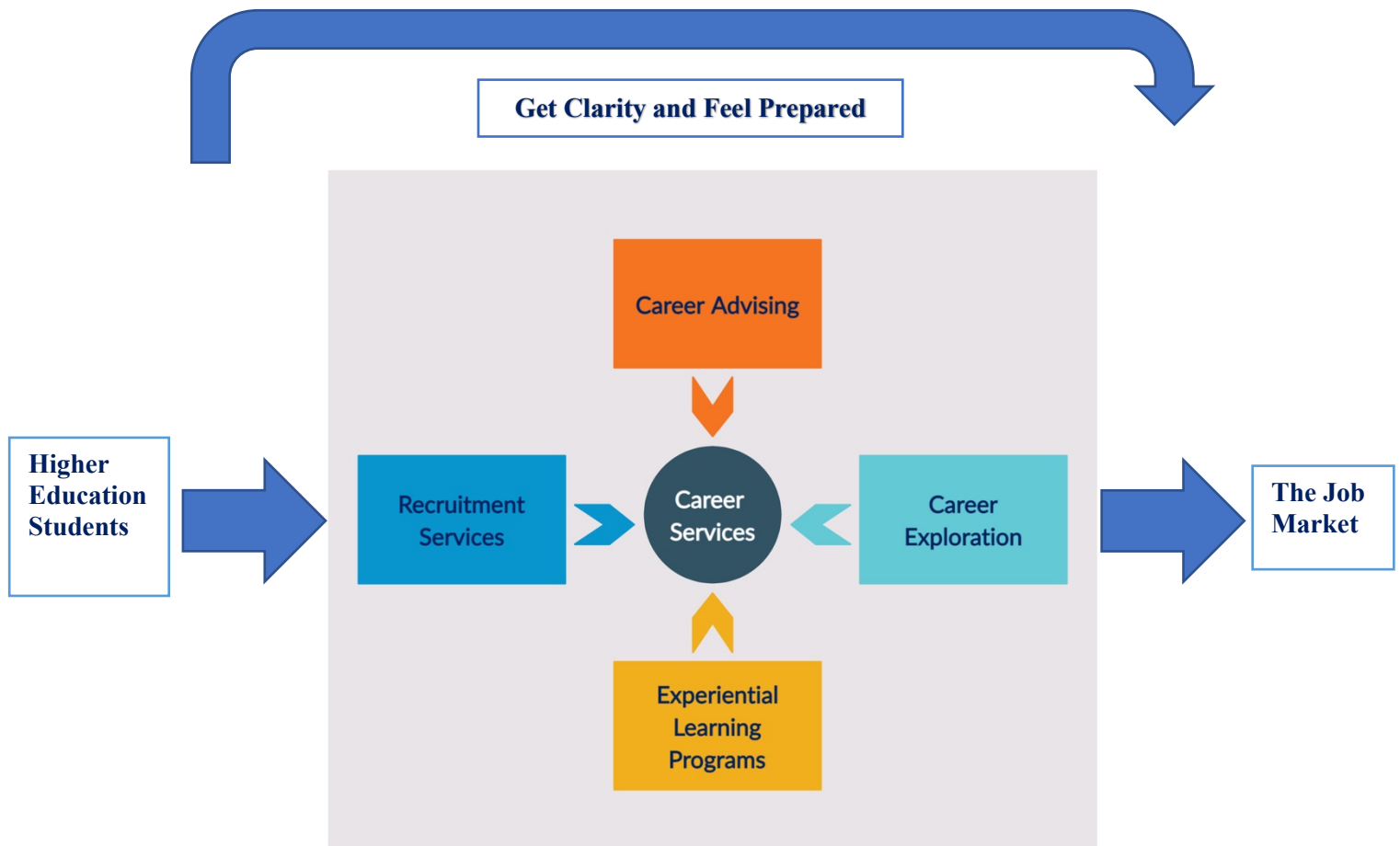
Figure 1: Conceptual Framework